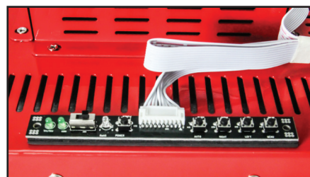
OSD Remote PCB