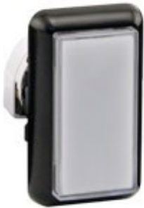
Gamesman Large Rectangle Pushbutton for Konami