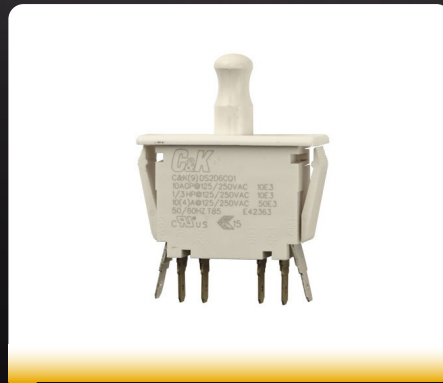
Interlock PB C&K DS2D6CQ1, 10A Push-Pull .187 X .020 Term.