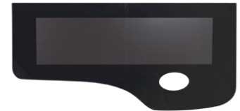
Bally Twinstar Complete