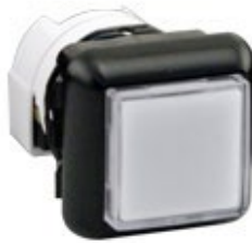
Gamesman Small Square Pushbutton for Konami