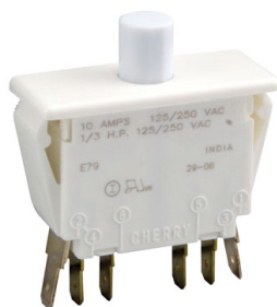
Interlock Switch, E79-40A