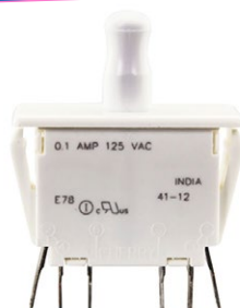
Cherry Switch 0.1 Amp .187 Terminals, E78-30A