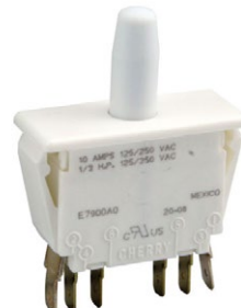
Interlock Switch, E79-00A