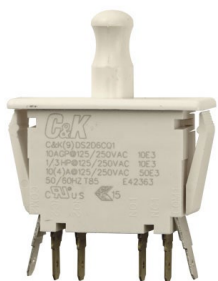
Interlock PB C&K DS2D6CQ1, 10A Push-Pull .187 X .020 Term.