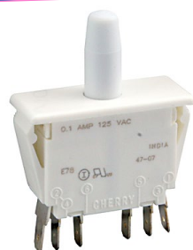
Interlock Switch, E78-00A