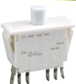
Interlock Switch, E78-40A