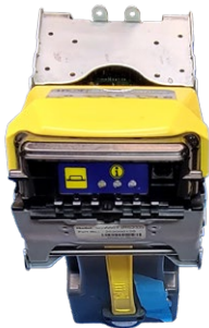
SCN6607 Advanced COMPLETE UNIT