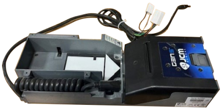
JCM Gen 5 Dual Port Printer IGT Version W/ 8-Pin