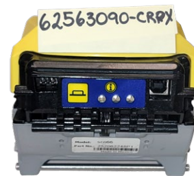
SCN6602 Advance HEAD ONLY