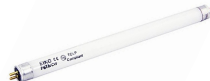
F6T5C 9" Cool White Economy Fluorescent Lamp