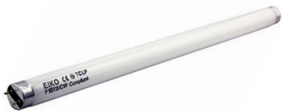
F15T8 18" Cool White Economy Fluorescent Lamp