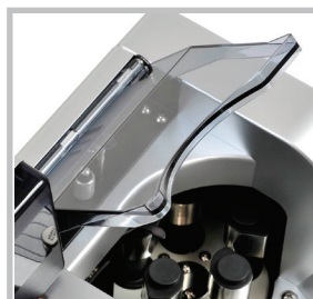
Dust guide lid