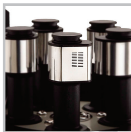
20 holes suction spindle