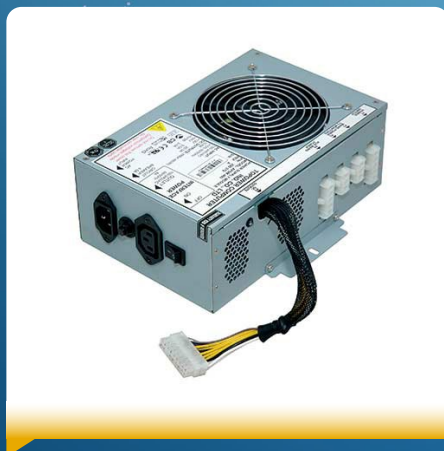
Ainsworth Power Pro Supply 460 Watts F/A560 Machines