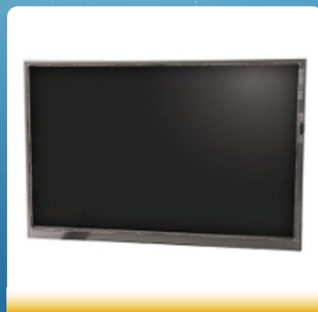
Reconditioned 22" MLD Monitor