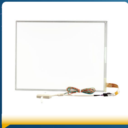
20.38" 3M Touch Screen with Novram for IGT 98-0003-4250-5