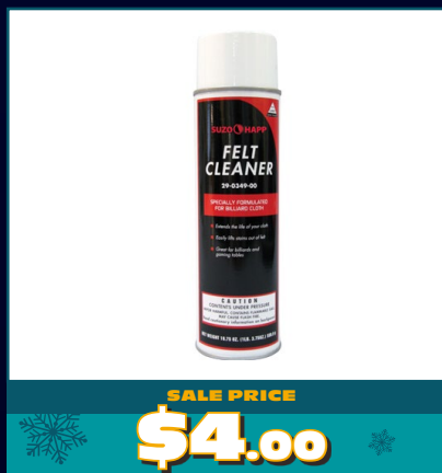
SUZOHAPP Felt Cleaner