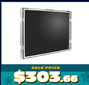
VisionPro 21.5" LED LCD W/Clear Glass HDMI, DVI, & VGA