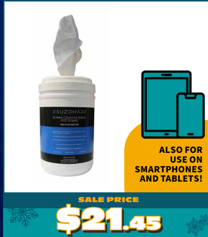
Screen Cleaning Wipes (100 Per Canister)