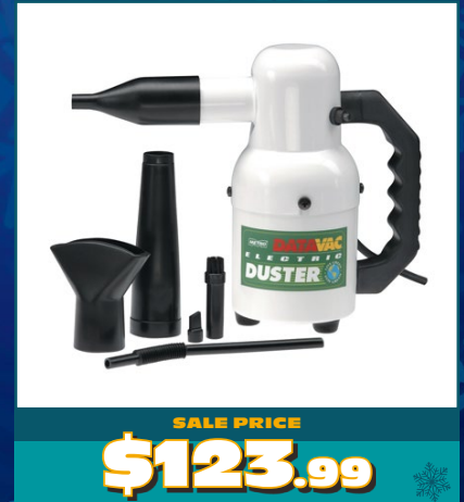
Datavac Electric Duster