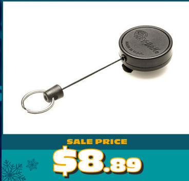
KEY-BAK Model 6 Key Reel