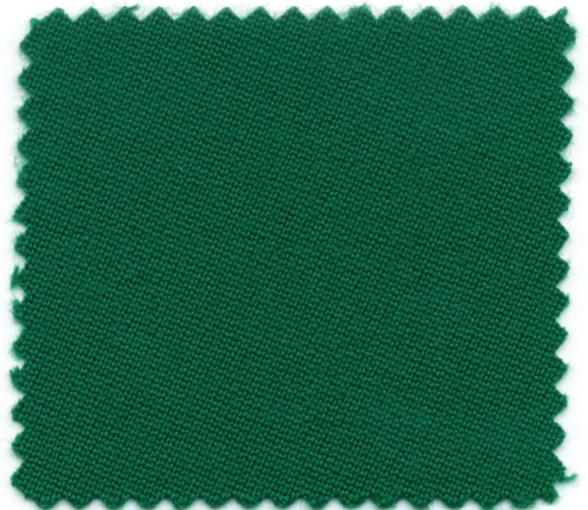
#860 SIMONIS GREEN

The original Simonis cloth. A wool-nylon blend, nap-free to eliminate pilling and shedding for long wear and more consistent play. Recommended for straight pool, eight ball and one-pocket.