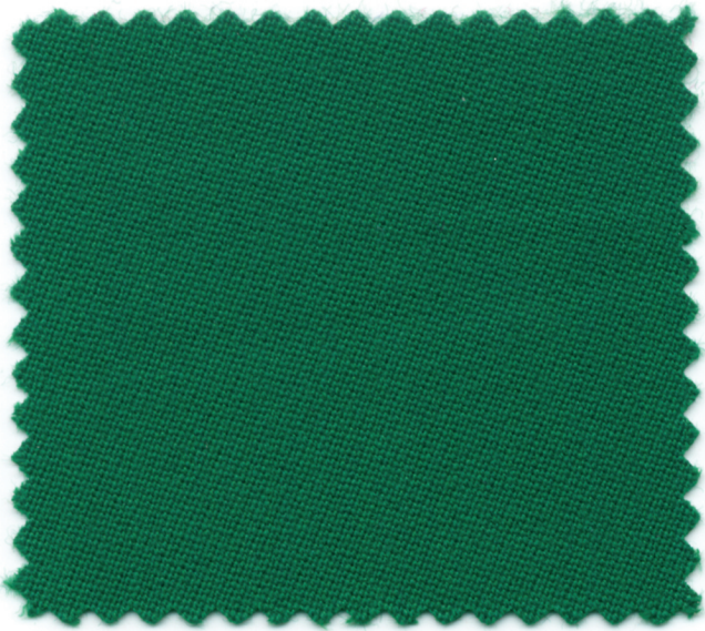
#760 SIMONIS GREEN

The original Simonis cloth. A wool-nylon blend, nap-free to eliminate pilling and shedding for long wear and more consistent play. Recommended for straight pool, eight ball and one-pocket.