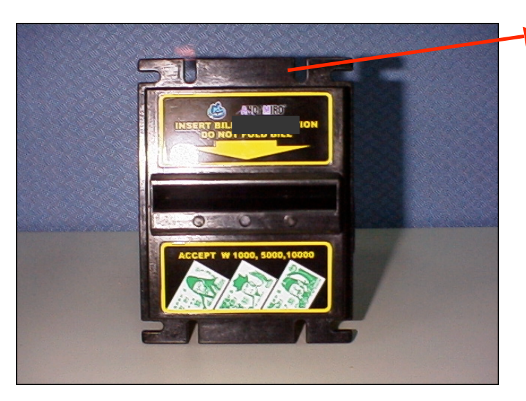
Remove the current EPROM from the validator.

Remove the plastic cover on the bottom of the bill acceptor with the screwdriver.