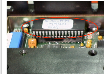
Please note that the pins should not be curved or bent.