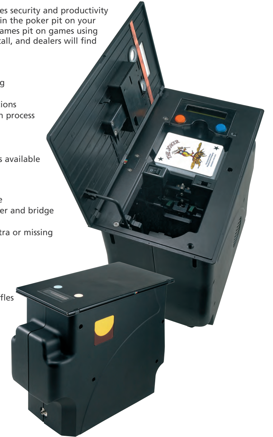
Part No. 15-01-10001-000

Power Requirements: 100-240 VAC/50-60Hz, 0.5 ampere Dimensions: Depth 11.5" (29.2 cm) Width 6.5" (16.5 cm) Height 11" (27.9cm) Weight: 15 lbs. (6.8 kg)