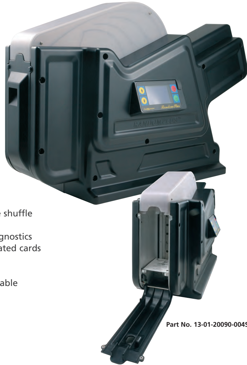
Part No. 13-01-20090-0045