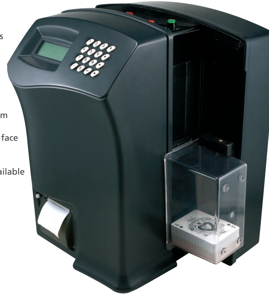
Part No. 12-01-10416-3005