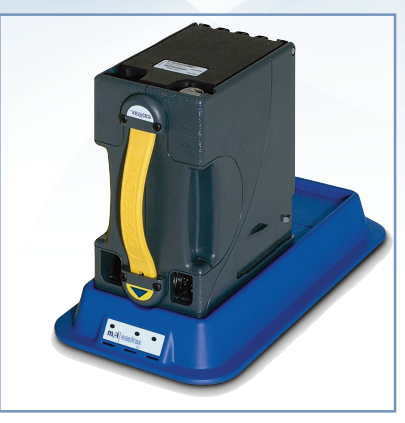
RFID Enabled Cashbox